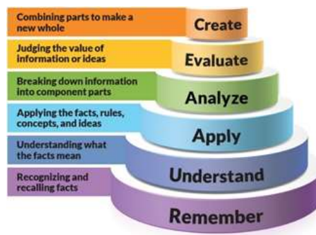
FIGURE 2: Revised version of Bloom's taxonomy