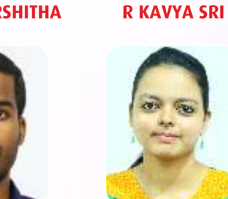
17951A0349 - CSE