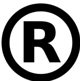
The Trademark Registration Logo